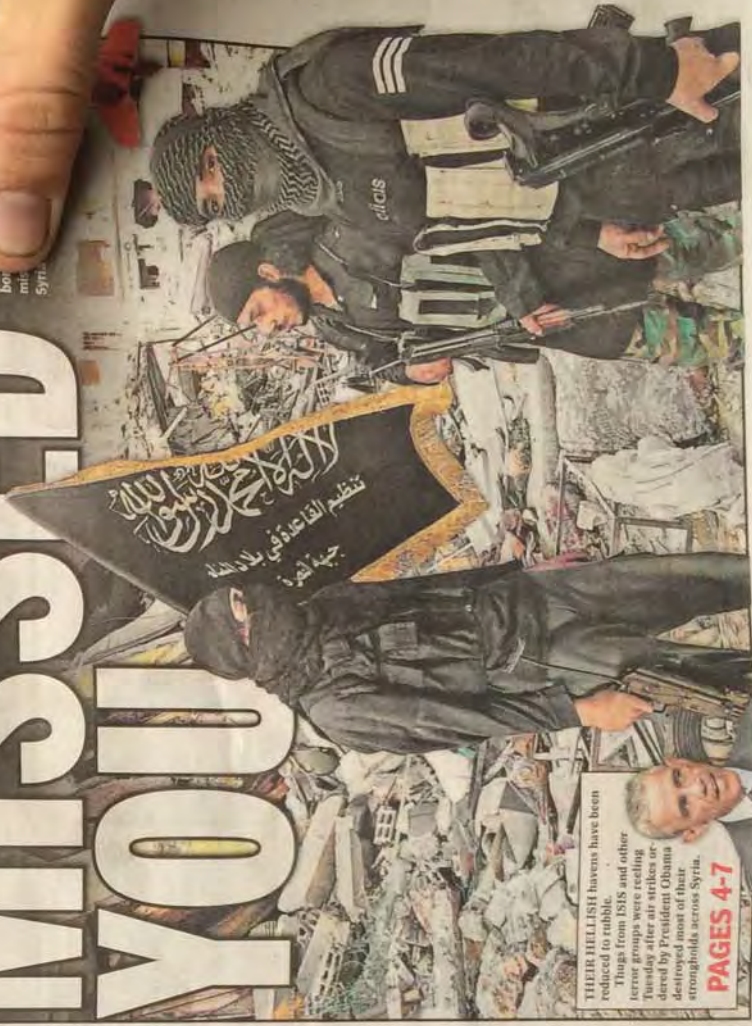
THEIR HELLSHaven have been reduced to rubble. Things from ISIS and other terror groups were reeling. The group's leaders and strongholds were destroyed in airstrikes ordered by President Obama.