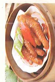
鳳爪 $4.25 Chicken Feet