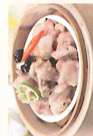
豉汁蒸排骨 $4.25 Steamed Spare Ribs w/ Olive Sauce