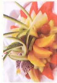
水果盤 $8.25 Fresh Fruit Platter