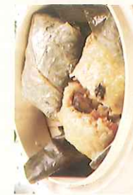
珍珠羹 $5.25 Sticky Rice w/ Pork Wrapped in Lotus Leaf (2)