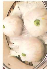
羅漢齋餃 $5.25 Buddha Delight Dumpling (3)