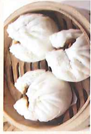
叉燒包 $5.25 BBQ Pork Buns (3)