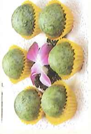
綠茶圓 $4.25 Crispy Green Tea Rice Ball (3)