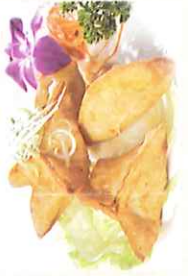
菠蘿芝士蝦卷 $5.25 Pineapple Cheese Wonton (4)