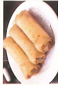
蔥絲春卷 $6.25 Shredded Roast Duck Spring Roll (3)