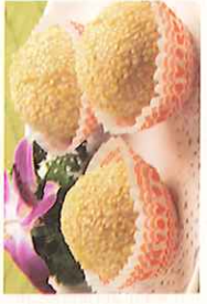
麻蓉蓮蓉球 $4.25 Sweet Sesame Ball (3)