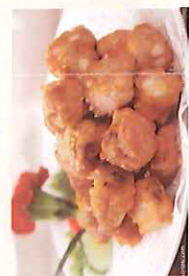
蒜香排骨 $7.25 Crispy Garlic Spare Ribs