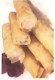
香脆蝦卷 $5.25 Shrimp Roll (3)