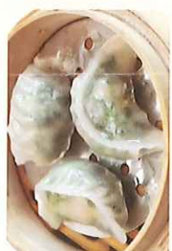
香茜芋蔥餃 $4.25 Taro Chiantrio & Pork Dumpling (3)