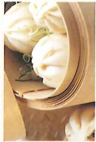
鮮蝦菜肉包 $5.25 Pork & Shrimp w. Veg Bun (3)