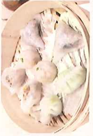
素菜點心拼盤 $13.25 Vegetarian Dim Sum Platter (8)