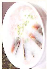
皮蛋瘦肉粥 $5.95 Pork & Thousand Year Egg Congee