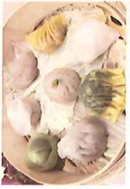
點心拼盤 $13.25 Palace Dim Sum Platter (6)