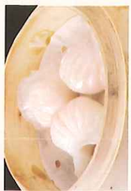
蝦餃 $5.25 Shrimp Dumpling (4)