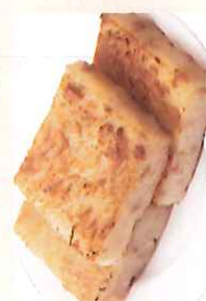
煎蘿蔔糕 $5.95 Pan Fried Turnip Cake