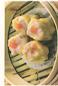
海鮮燒賣 $5.25 Seafood Shu Mai (4)