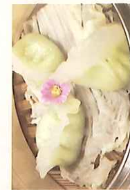
毛豆餃 $5.25 Soy Bean Dumpling (3)