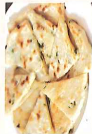
蔥油餅 $5.95 Scallion Pancakes