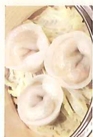
鴨絲餃 $5.25 Shredded Roast Duck Dumpling (3)