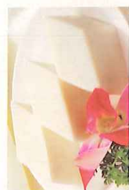
椰汁糕 $5.25 Coconut Cake (3)