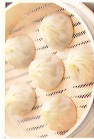
上海小籠包 $7.25 Shanghai Juicy Pork Bun (6)