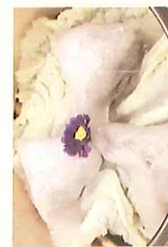
三菇餃 $5.25 Mixed Mushroom Dumpling (3)