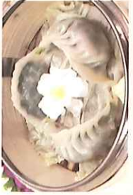
京蔥餃 $4.25 Pork and Chive Dumpling (3)