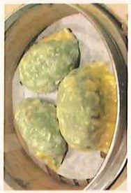
素菜鮮蝦餃 $5.25 Steamed Shrimp & Chives Dumplings (3)