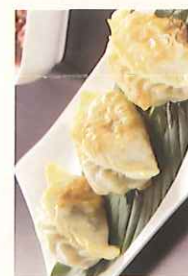
煎香蔥油餅 $5.95 Pan Fried Pork & Chives Dumplings (3)