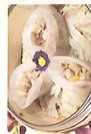
竹筴餃 $5.25 Bamboo Shoot Dumpling (3)