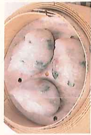
潮州粉果 $5.25 Chou Zhou Dumplings w. Pork & Peanut (3)