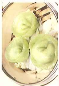
海鮮豆腐餃 $5.25 Seafood Peashoot Dumpling (3)