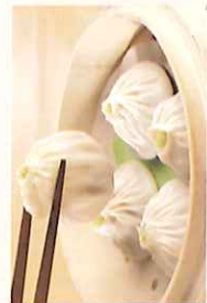
蟹肉小籠包 $9.25 Crabmeat Juicy Pork Bun (6)