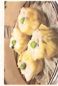
雞燒賣 $4.25 Chicken Shu Mai (4)