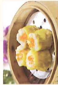
燒賣皇 $4.25 Shu Mai (Shrimp & Pork) (4)