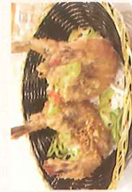
椒鹽焗雞 $10.25 Salt & Pepper Jumbo Shrimp (w/Steal)