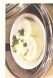
客家釀豆腐 $5.25 Shrimp Stuffed Tofu (3)