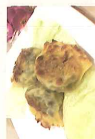
煎鮮蝦韭菜餃 $5.95 Pan Fried Shrimp & Chives Dumplings (3)