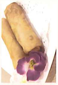
素菜春卷 $3.95 Vegetable Spring Roll (2)