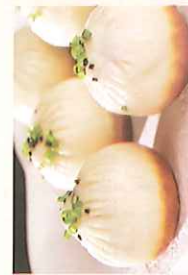
生煎包 $5.95 Pan Fried Tiny Bun (3) (Pork, Shrimp & Veg)