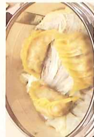
雞肉餃 $4.25 Chicken Dumpling (3)