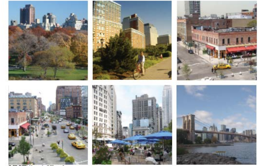
NYC Mayor's Office of Environmental Coordination