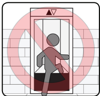
Elevator not level with floor