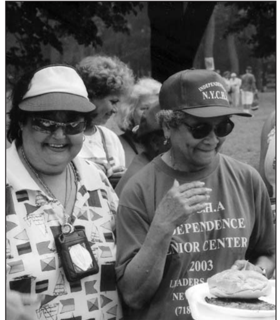
These seniors enjoyed the fare at the Ridgewood Bushwick Senior Center picnic held at Sunken Meadow on July 24, 2003. The event has grown from a few hundred seniors and 15 volunteers in 1972 to over 4,000 seniors and more than 200 volunteers.