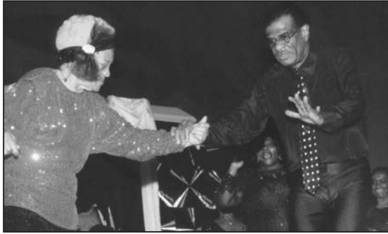
NYCHA SENIORS kick up their heels at the old Savoy in Harlem in the musical "Memoirs — A Senior's Tale" at the June Festival.