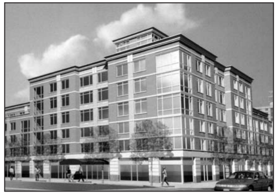
PHASE III The photo above shows the preliminary design for Phase III of the Prospect Plaza project which will include retail space, a multi-purpose center and approximately 80 apartment rental units.