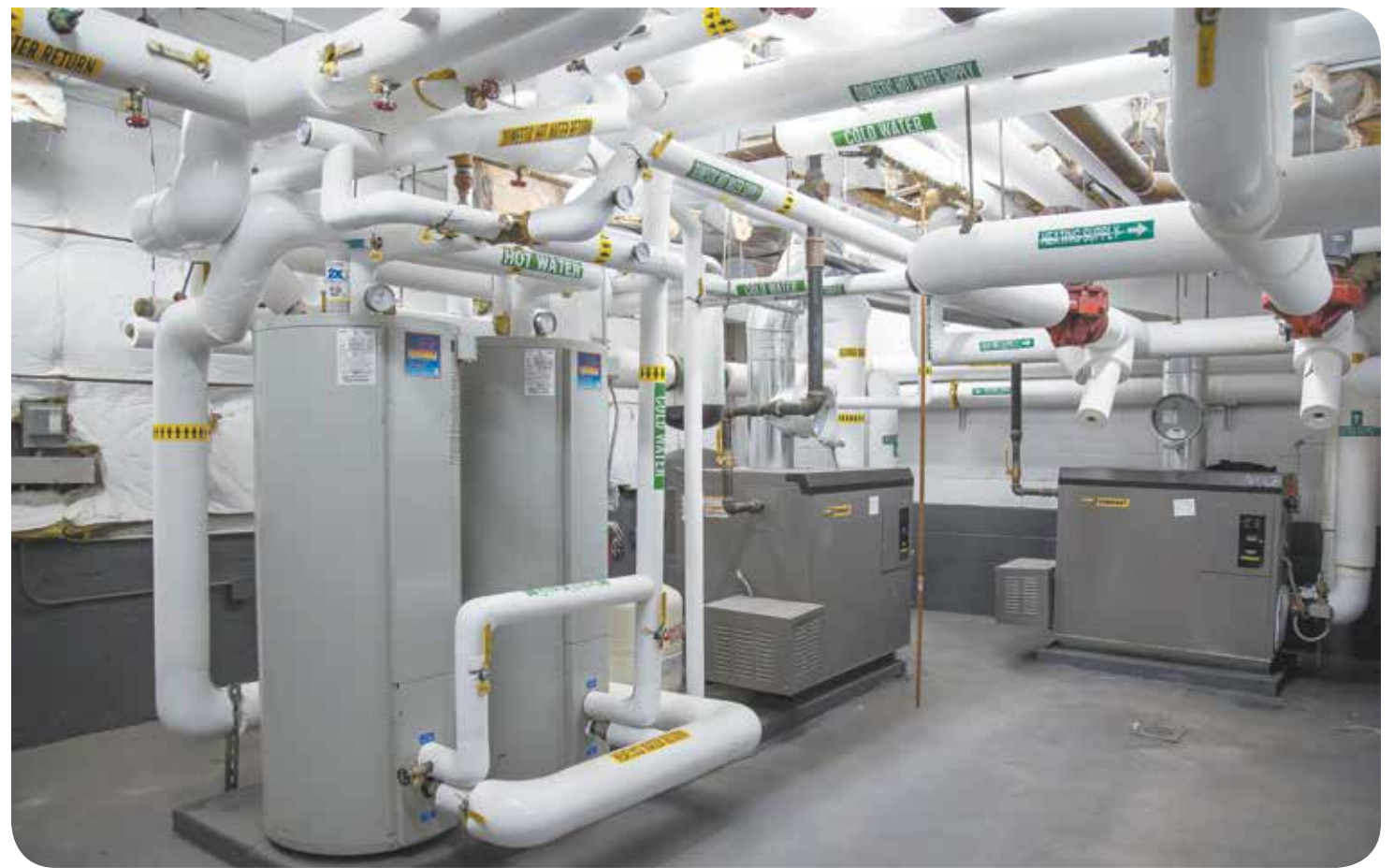
An example of a new hot water system.

The primary goal of NYCHA's EPCs is to upgrade and modern-