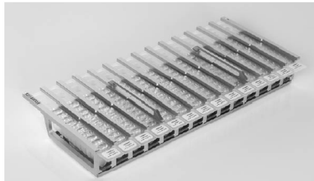
Reagent cartridge rack with cartridges loaded