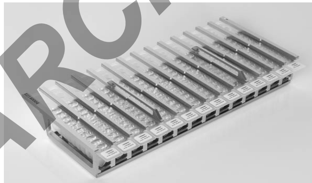
Reagent cartridge rack with cartridges loaded