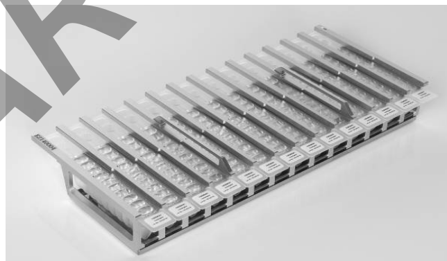
Reagent cartridge rack with cartridges loaded