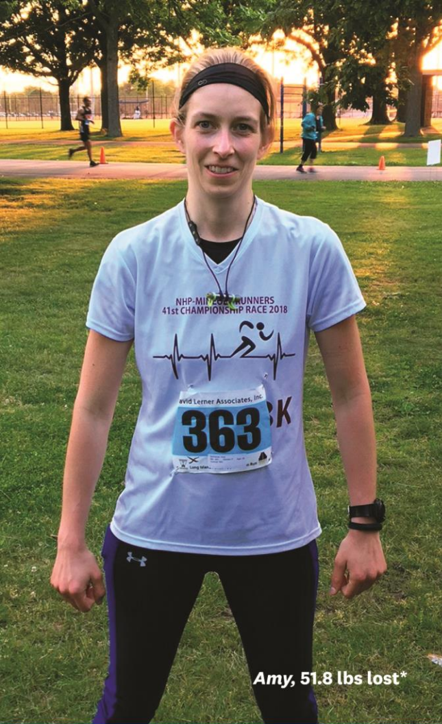
Amy, 51.8 lbs lost*

*People following the WW plan can expect to lose 1-2 pounds per week.