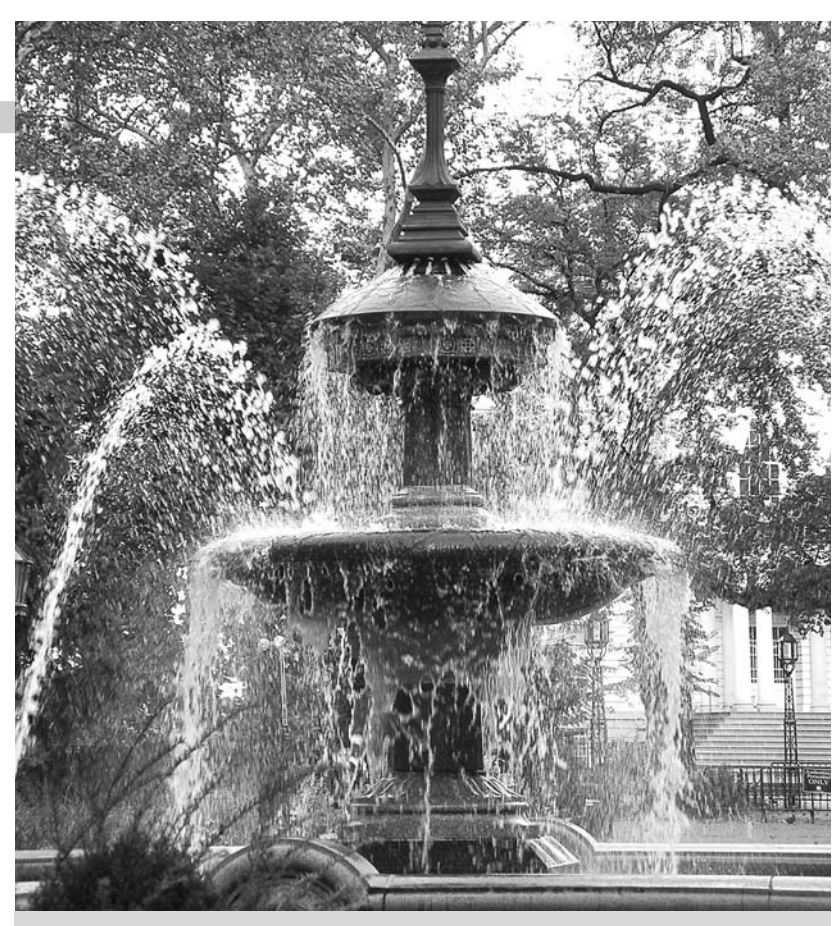
The City of New York Michael R. Bloomberg, Mayor