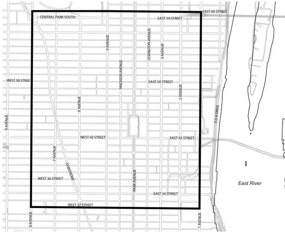
Map 2 - Area where public parking lots are not permitted in the downtown Manhattan Core