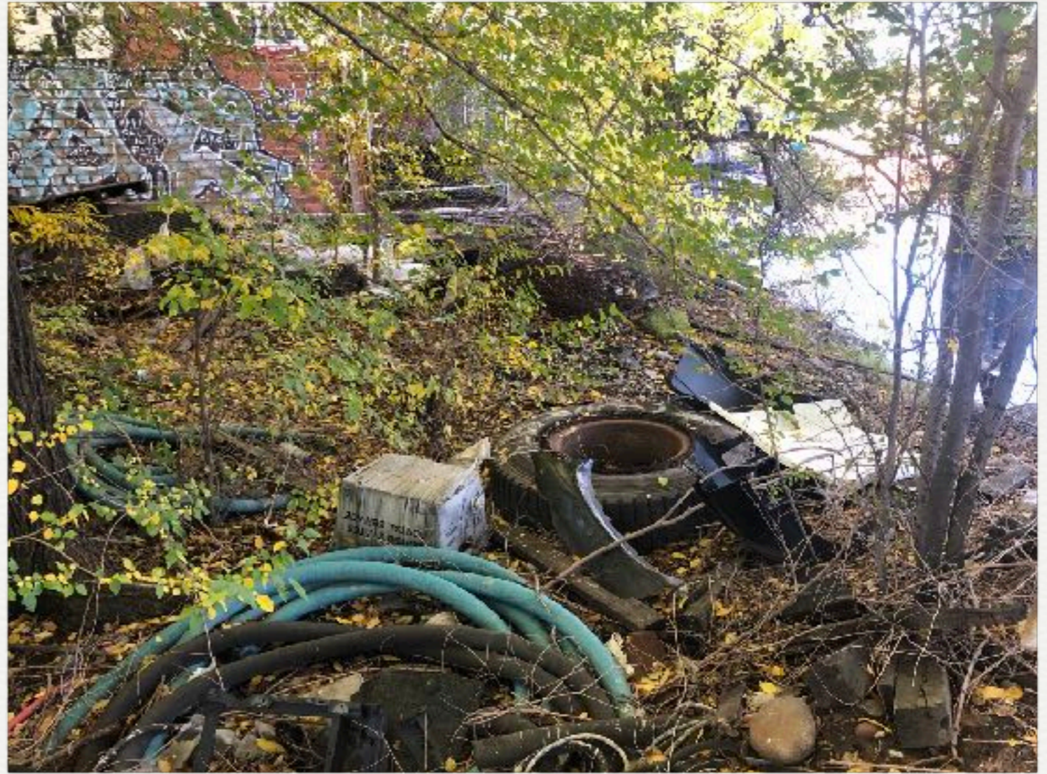
Borden Ave under the LIE Before November Cleanup