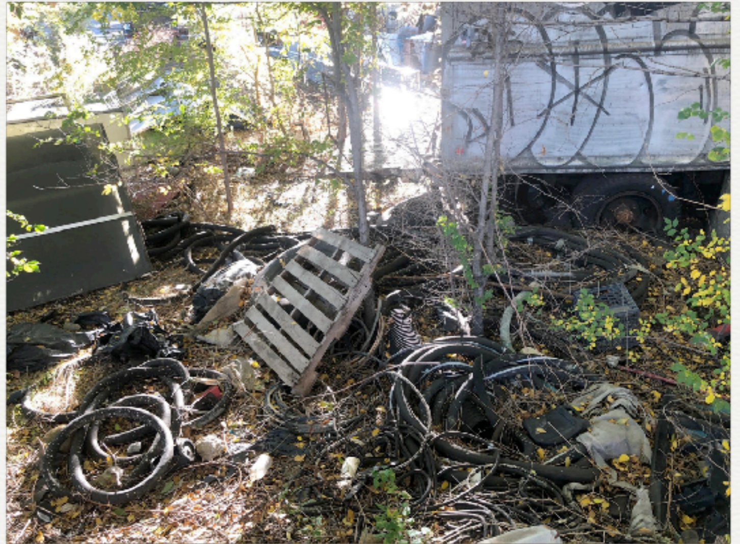
Borden Ave under the LIE Before November Cleanup