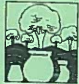
Whitepot Settled 1653