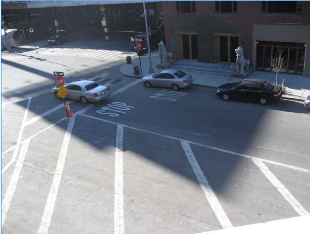
Existing Northwest Corner of 12 th Avenue at W. 135 th Street