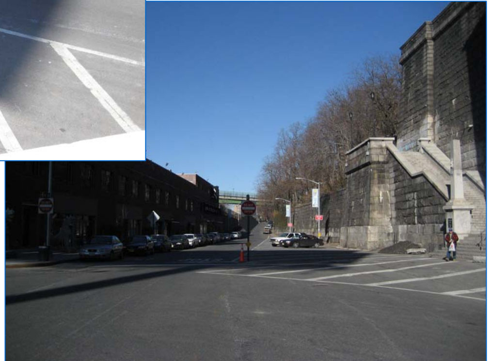
Existing 12 th Avenue North from W. 135 th Street