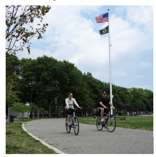
Marine Park Path

27% of Bensonhurst & Bay Ridge residents 17% of Sheepshead Bay & Coney Island residents ride a bike (at least once in past year) Source: 2014 NYC Community Health Survey