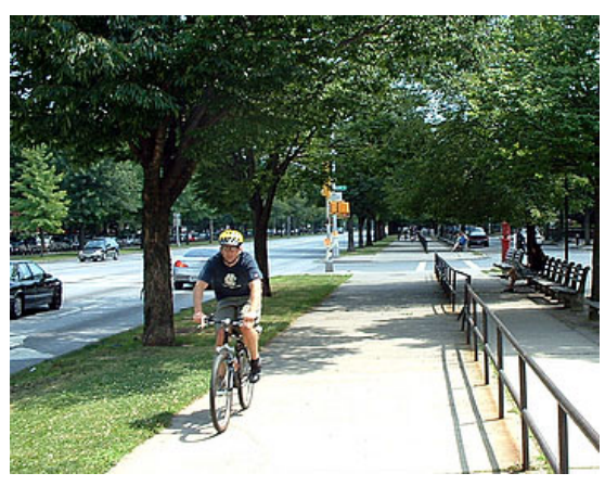
Ocean Parkway Greenway 1200+ cyclists

27% of Bensonhurst & Bay Ridge residents 17% of Sheepshead Bay & Coney Island residents ride a bike (at least once in past year) Source: 2014 NYC Community Health Survey