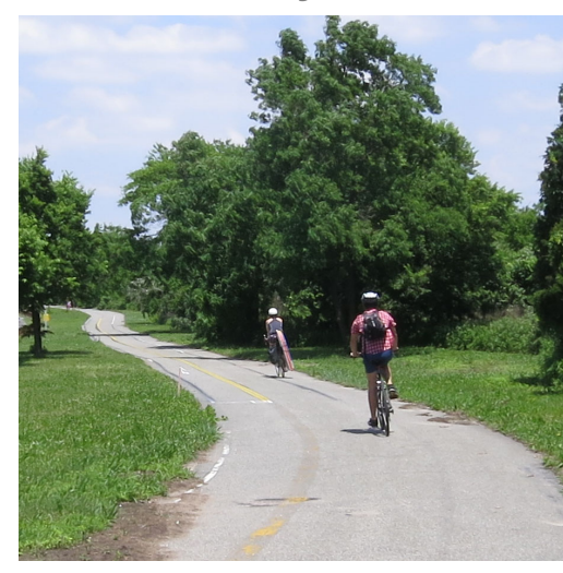
Jamaica Bay Greenway 1600+ cyclists