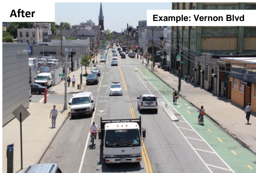
Example: Vernon Blvd