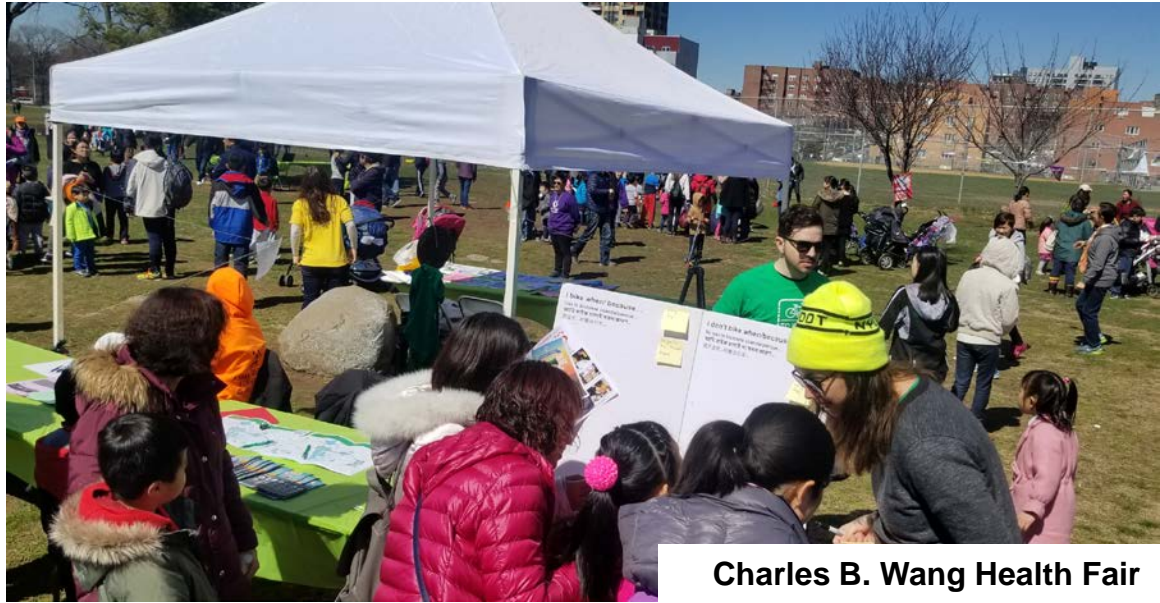
Charles B. Wang Health Fair