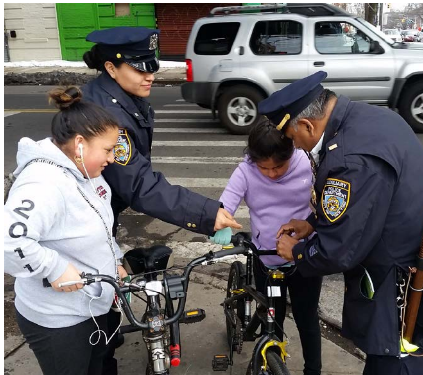
Bike Light & Bell Giveaway with 110 th Precinct, 2017