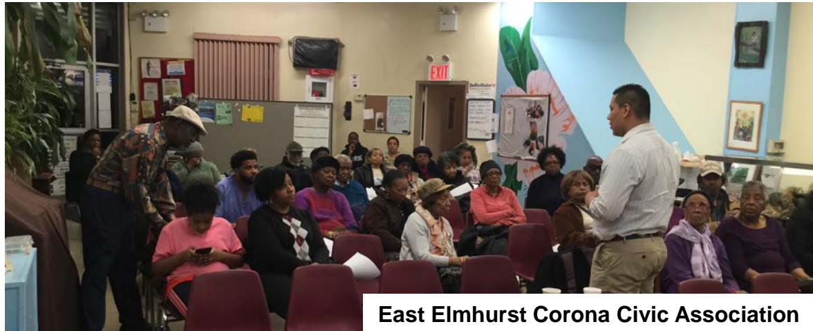
East Elmhurst Corona Civic Association