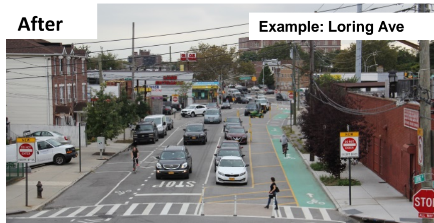
Example: Loring Ave