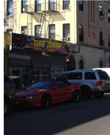
Irving Ave, Brooklyn BEFORE

No parking loss: typically fits in between existing travel and parking lanes