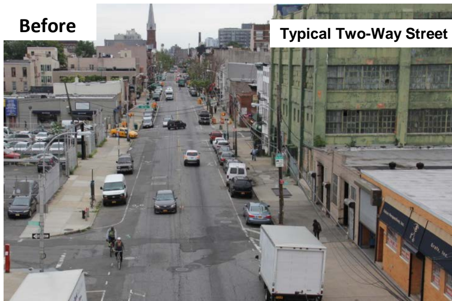
Typical Two-Way Street