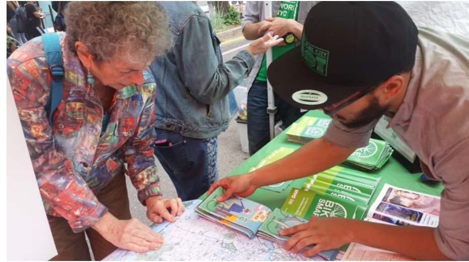
Outreach at 75 th St and 37 th Rd