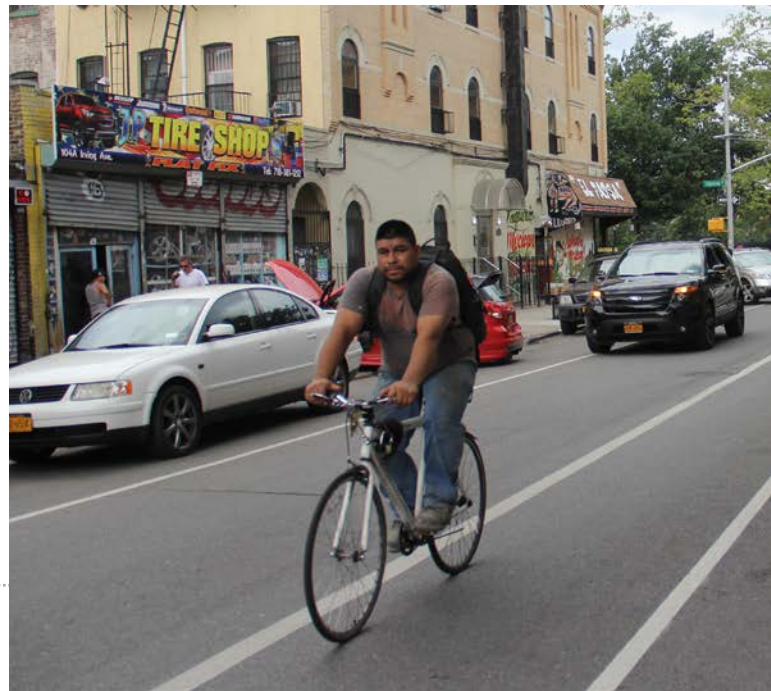
Tremont Ave, Brooklyn, AFTER