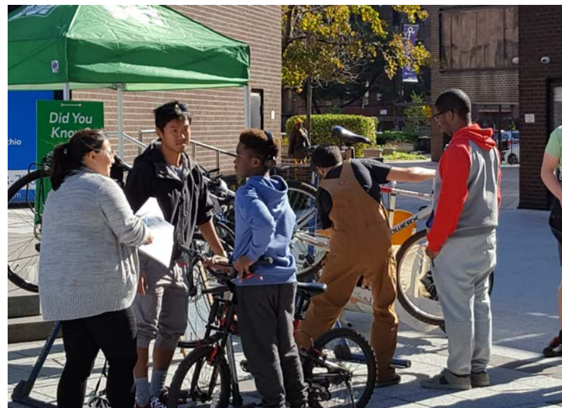
Free Bike Repairs, Biketoberfest 2017