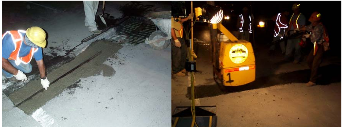
Pouring Concrete on the Westbound BQE Over Furman Street. Rolling and Tamping the Asphalt.