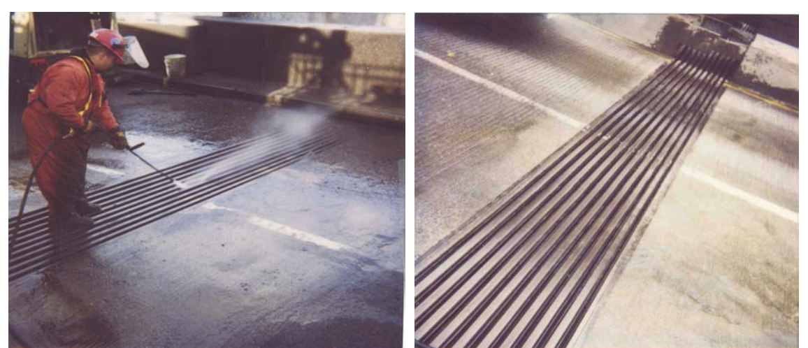
Expansion Joint Cleaning on the Manhattan Bridge

Cleaning of Expansion Joints Removal of debris and dirt from the troughs using compressed air or water; and cleaning and resealing of the joints. Performed on all bridges. Expansion joints are located at the surface level where they are subjected to impact and vibration and are exposed not only to the elements such as water, dust, grit, ultra-violet rays and ozone, but also to the effect of chemicals such as salt solutions, cement alkalis and petroleum derivatives. In addition to regular lubrication of moving parts, penetration of water, silt and grit must be effectively prevented or provision made for their removal.