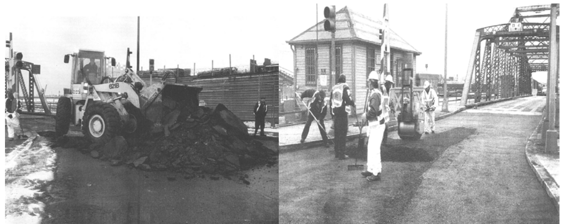
Asphalt Repair on the Grand Street Bridge

Replacement of Wearing Surfaces exposed concrete slab or steel plate; installation of new wearing surface. The wearing surface is a two-inch course of bituminous concrete. Also includes minor deck repair, cleaning and waterproofing of deck.