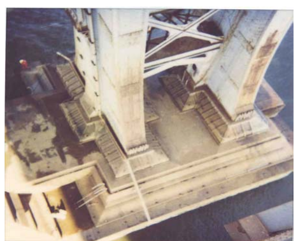
Manhattan Bridge Tower After Debris Removal

Debris Removal Removal of spilled trash; removal of rocks, wood, plastic or metal objects, tires, mufflers, wheel covers, and other traffic droppings; removal of paper products, bottles, cans, accumulated dirt and other trash. Debris removal is also required for walkways and plazas. For movable bridges and bridges over water, the protective fender systems need to be cleared of debris. The removal of debris from bridges is an important and critical component of maintenance. Debris can cause safety and hazard conditions. In addition, debris traps moisture and salts on the structure and prevents proper drainage.