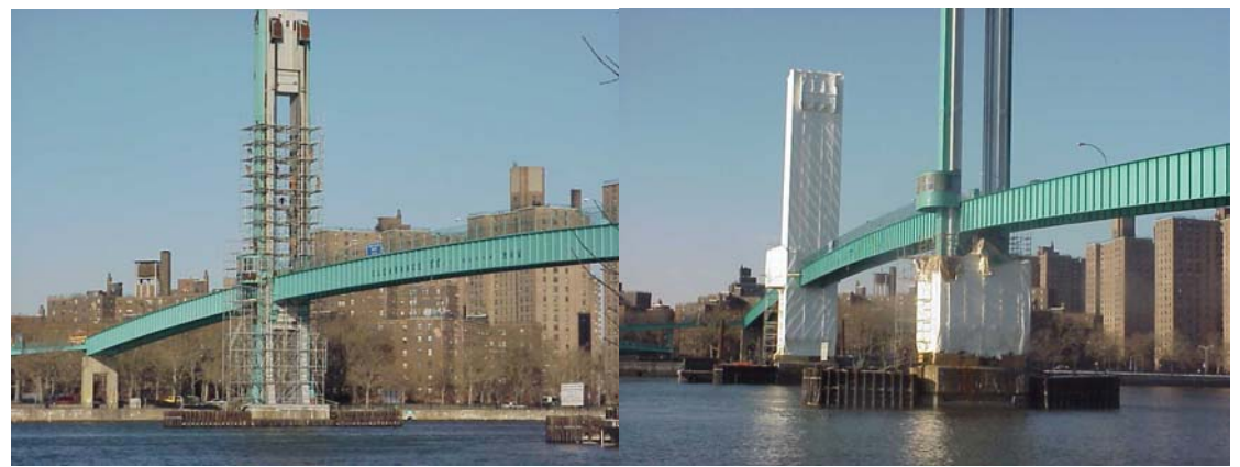
Tower Scaffolding and Containment at the Wards Island Pedestrian Bridge