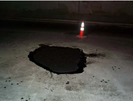
Closeup of Part of the Completed Concrete Deck Repair on the BQE.