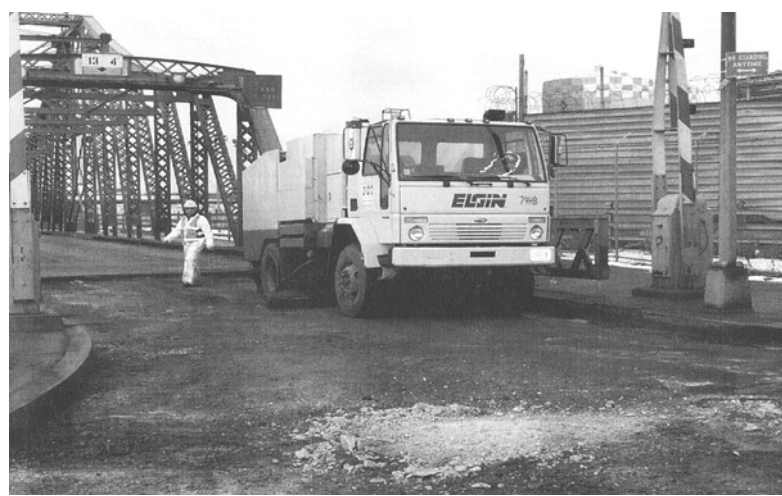
Sweeping the Grand Street Bridge