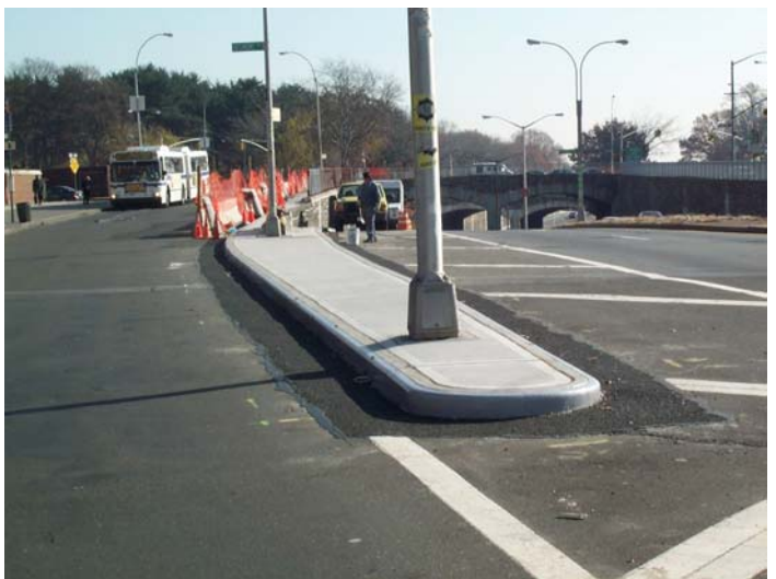
Repaired Bullnose Curb and Sidewalk at Crotona Avenue

Repair of Sidewalks and Curbs Sidewalk repair to restore sidewalk to original condition. Curb repair to be undertaken along with this task.