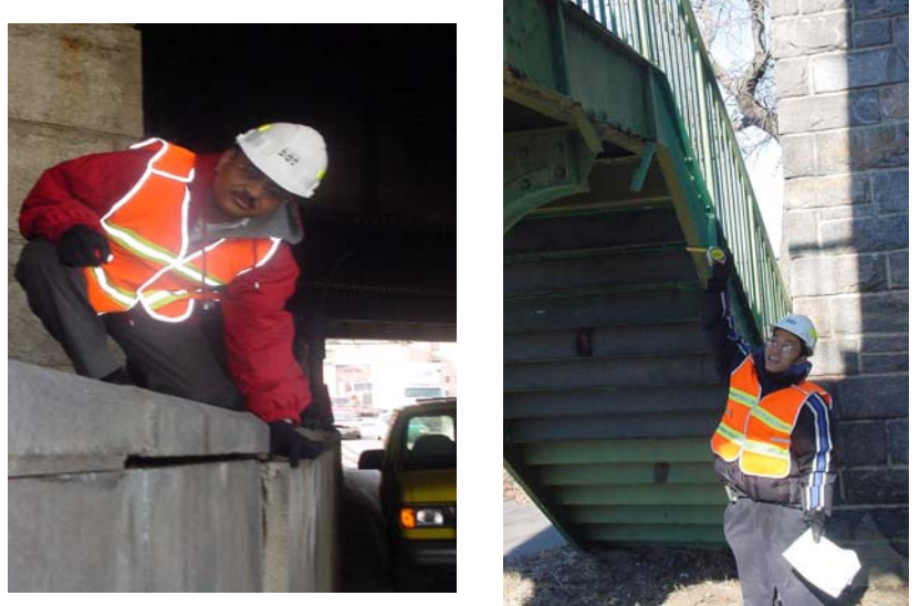
Flag Engineer Inspecting a Yellow Flag (Loose Masonry Panel) on the BQE under the Brooklyn Bridge Flag Engineer Inspecting a Yellow Flag (Bottom Flanges are Corroded and Loose) at the Inwood Hill Park Footbridge

Yellow Flag is used to report a potentially hazardous condition which, if left unattended beyond the next scheduled inspection, would likely become a clear and present danger. A Yellow Flag is also used to report the actual or imminent failure of a non-critical primary structural component, where its failure may diminish the reserve capacity or redundancy of the bridge but would not result in structural collapse or a clear and present danger.