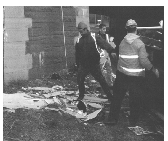
Hutchinson River Parkway Under Westchester Avenue

Removal of debris, dirt and vegetation from Cleaning of Drainage System drainage systems, including gutter gratings, gutters and leaders, scuppers, down spouts and scupper piping systems. The cleaning of surface gratings and gutters requires hand tools, brooms and brushes. In some cases, an air compressor might be needed to blow out some gutters. Cleaning the scuppers and scupper piping systems requires specialized equipment.