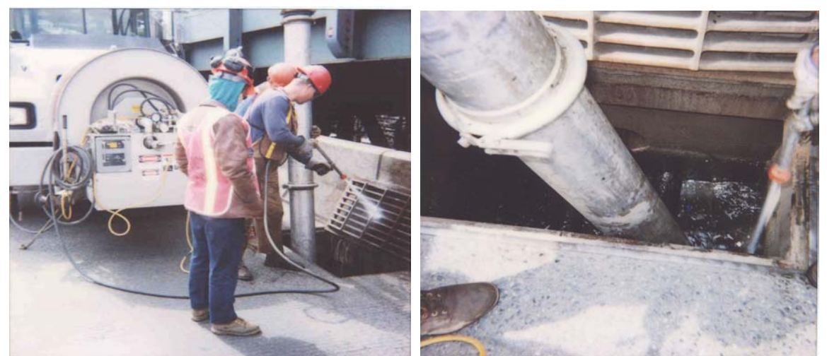
Cleaning Catch Basins on the Manhattan Bridge

Removal of debris, dirt and vegetation from Cleaning of Drainage System drainage systems, including gutter gratings, gutters and leaders, scuppers, down spouts and scupper piping systems. The cleaning of surface gratings and gutters requires hand tools, brooms and brushes. In some cases, an air compressor might be needed to blow out some gutters. Cleaning the scuppers and scupper piping systems requires specialized equipment.