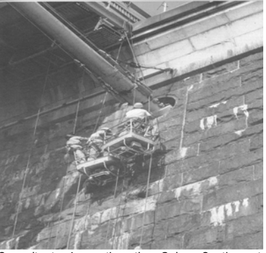
Consultants Inspecting the Splay Casting at Anchorage D of the Williamsburg Bridge, Where the Suspension Cables are Secured

A steel or cast-iron collar fitted around a bridge suspension CABLE at the location where it spreads out (splays) into separate bundles of wires which are then attached to the ANCHORAGE EYEBARS. It is used to control the degree and location of the splay. These castings are usually located at the entry point of the cable into the anchorage chamber.