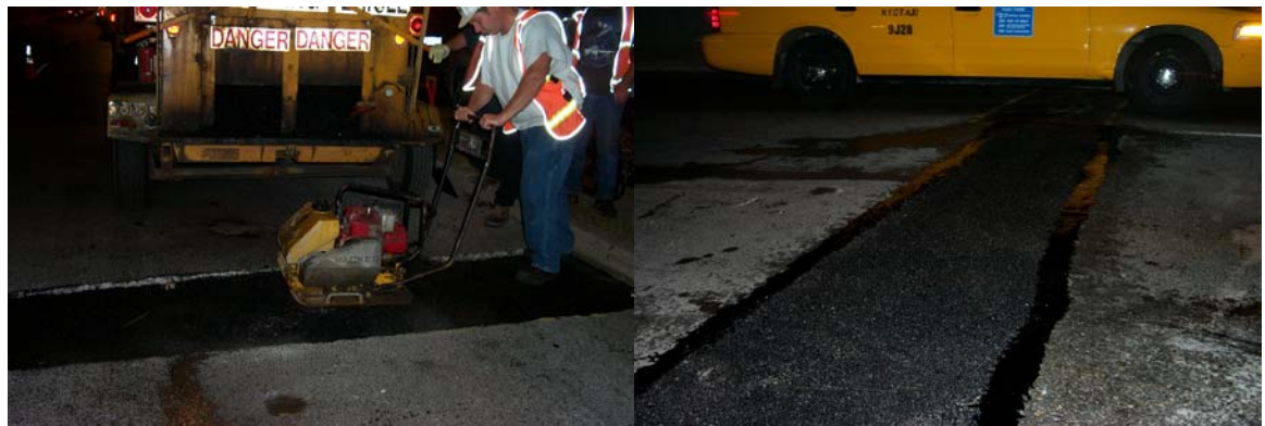
Compacting the Hot Asphalt Cement With a Portable Gasoline Powered Roller. Completed Asphalt Deck Repair at the Tillary Street Ramp.