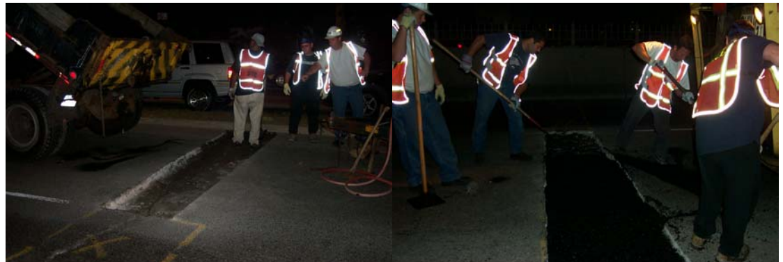
Break-Out and Removal of Old Asphalt at the Tillary Street Ramp to the Brooklyn Bridge