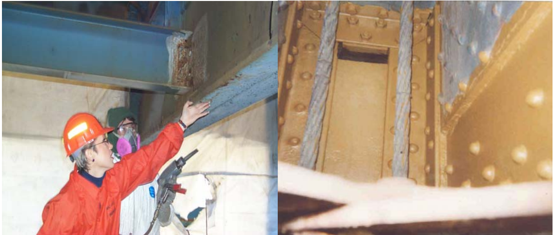
Spot Cleaning Before Painting on the Williamsburg Bridge. Primer Coating on the Williamsburg Bridge

Salt Splash/Spot Painting This is a new process that combines salt splash with spot painting. It involves preparation of the area to be painted by power wash, using clean water or steam. Solvent cleaning is done in locations where oil and grease need to be removed from the steel surface. Areas to be power washed and painted are: the superstructure (up to six feet upwards from the deck), the underdeck steel (up to three feet from each side of the center line of the expansion joints), and the outside of the bridge's steel faces. In addition to these painted areas, we now perform localized surface preparation and painting of any deteriorated locations as mentioned in our spot painting definition above. After power washing, hand and power tools are used in areas that have started to show deterioration from accumulated de-icing agents. Power tool cleaning is performed in a Class 3P containment, and hand tool cleaning in a Class 4 containment. Combination hand/power tool cleaning is performed in a Class 3P containment, and hand tool cleaning in a Class 4 not primer coat and finish coat are then applied by brush or roller. Occasionally, when there is no danger of overspray, spray painting may be performed.