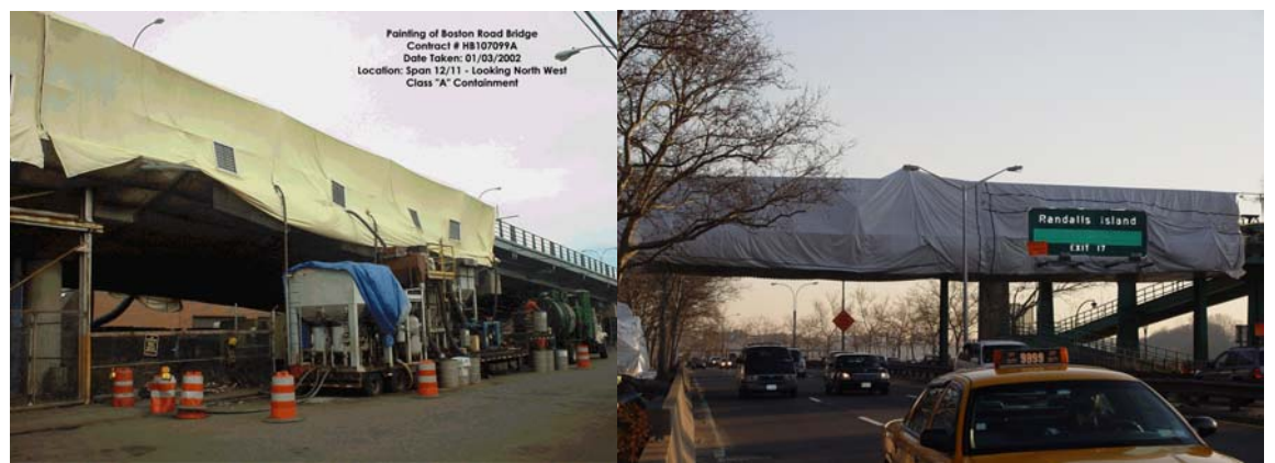
Boston Post Road Containment. FDR Containment for Wards Island Pedestrian Bridge.

The Division treats all lead paint waste as hazardous waste, and stores and disposes of it according to the Resourse Conservation and Recovery Act (RCRA). Waste is stored in approved leak-proof drums and containers which are, in turn stored temporarily in a fenced, secured area on-site until they are transferred to a disposal/recycling facility.