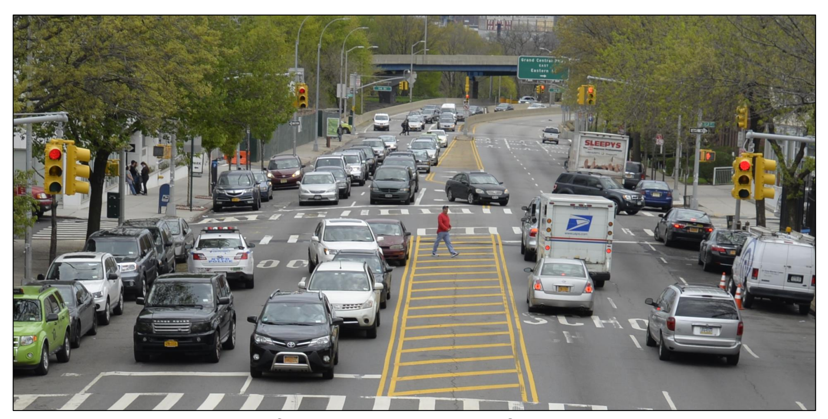
Existing Conditions: Northern Blvd & 112 St, looking east