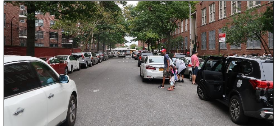
Before Conditions: 98 th St