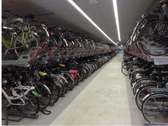
Delft Central Station Parking