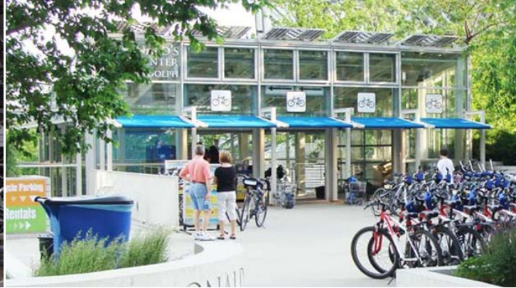
McDonald's Cycle Center, Chicago