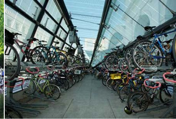
Bikestation Washington DC